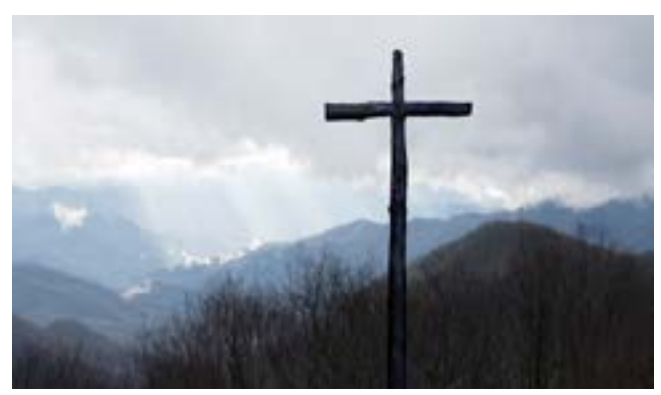
"I will cling to the old rugged cross, and exchange it one day for a crown"